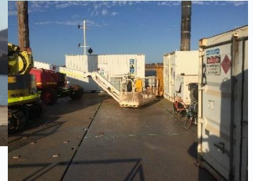
Deck space maximised to conduct works safely

United Industrial Solutions was contracted by Rio Tinto to carry out the refurbishment of various channel makers within Rio Tinto Shipping Channel. Utilising the UIS Ocean Driller Jack-up Barge which was mobilised from the Kaiser Marina Dampier the barge was located on location external of shipping lane enabling all works to be conducted with no shipping disruptions. Works consisted of the redesign of access ladders; fabrication; procurement; destruct works; surface preparation; remedial hot works; and recoating of the channel maker.