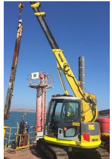
15T Crawler crane utilised for removal & reinstatement of access ladders

A key challenge of the project was accessing the scope front and executing the works safely. With real-estate on the barge a premium UIS opted for the utilisation of a 15T crawler crane to minimise foot print and the use of a EWP resulting in a non cluttered deck and clear work front for personnel. Works was conducted within budget, timeframe and to clients expectation.