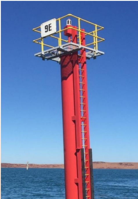
Typical Type A Channel Maker fully refurbished

Manufacture of access ladder and supply of all equipment and consumables to complete SOW.