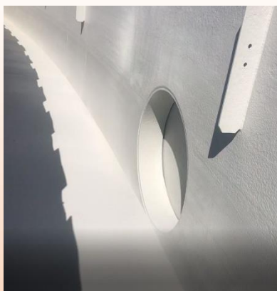
Completed Section of Laundry