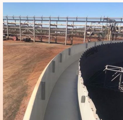
Completed Section of Laundry