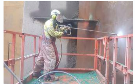
UHWP Wall Blasting

UIS worked closely with CPM / PPS personnel ensuring all hazards were addressed and actioned prior to any works being conducted, a safe work method utilising two (2) scissor lifts for access was introduced after a risk management assessment. Management of all personnel and third party activities was conducted by UIS including all asset supply and hire.