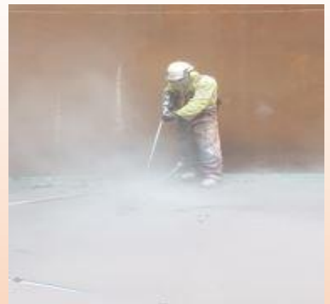
UHWP Floor Blasting